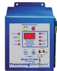
LT-1900 in NEMA 12 (IP 64) steel enclosure.