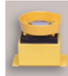
Palm Button with Ring Guard

Includes ring guard and mounting enclosure.