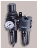
Miniature Regulator, Oiler, Filter